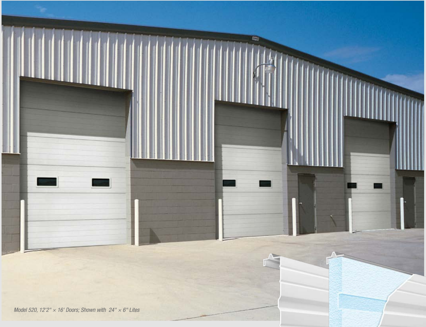
Model 520, 12'2" x 16' Doors; Shown with 24" x 6" Lites