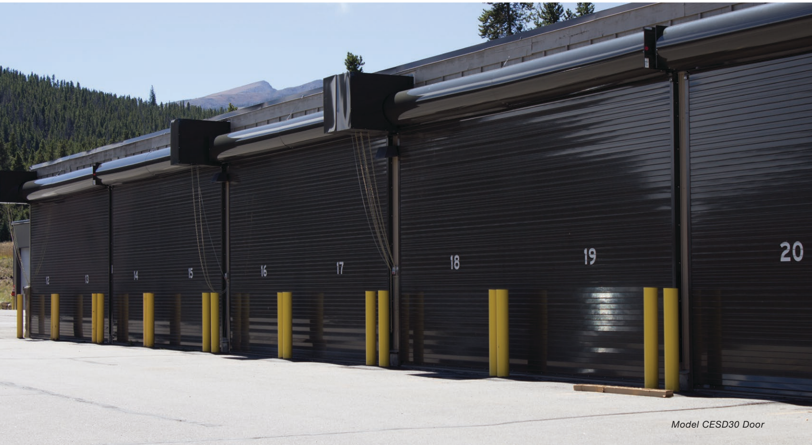
Model CESD30 Door